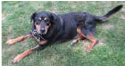
Jade, enjoying a summer day

Thank you so very much for giving me a chance to have her in my life. I'm sorry if this is rambling and too profound, but she was my dearest friend through so much, and I had to let you know how you changed one girl's and one dog's life. Thank you again and keep up the good work.