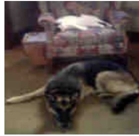
Wally and Fred